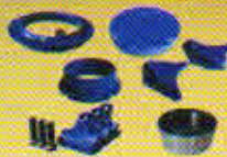
VSI Spare Parts