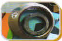
DUST SEAL RING