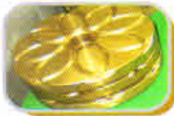
SHAFT WEAR RING