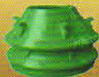
BOWL LINER & MANTLE