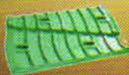
Every Storehouse board